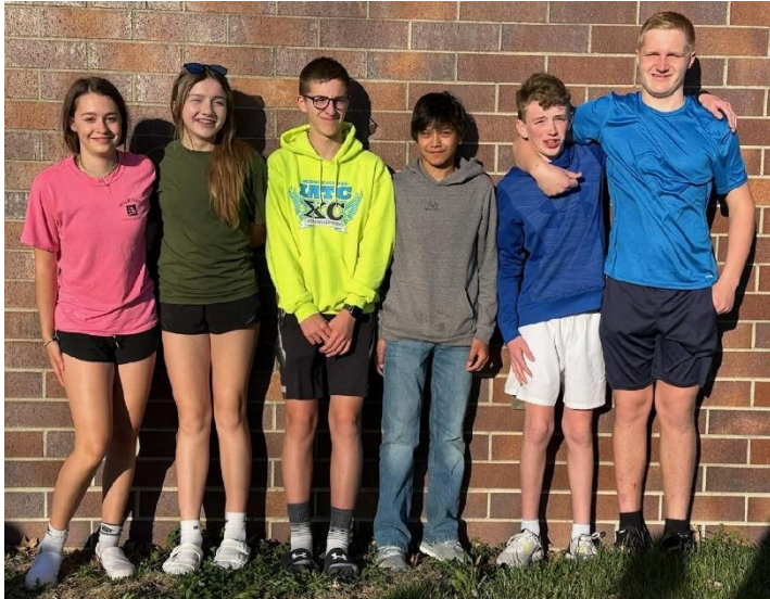
8 th Graders had a great time on their Class Trip to Branson

We 8 th graders went to Branson last week for our 8 th grade trip. We left on Thursday and went to the Dolly Parton Stampede that night. On Friday we went to Silver Dollar City for the whole day. On Saturday the boys went go-karting, and the girls went shopping. On Saturday night we went and watched Esther at the Sight & Sound Theatre. Sunday we went to church, and then came home.