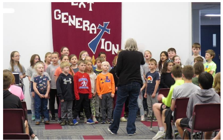
K-3 Grade Choir sang at Chapel today