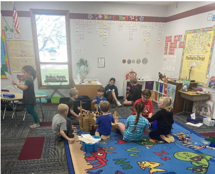
The Kindergarten class enjoyed having a snack and playing with the 5th graders