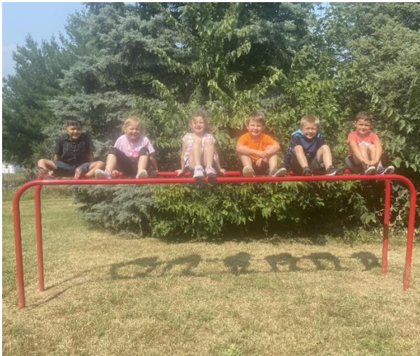
Enjoying a beautiful day at recess

We took a reading test. We took a quiz. We had P.E. and played with scooters. Christopher Columbus is who we learned about in Social Studies. We have school pictures on Monday