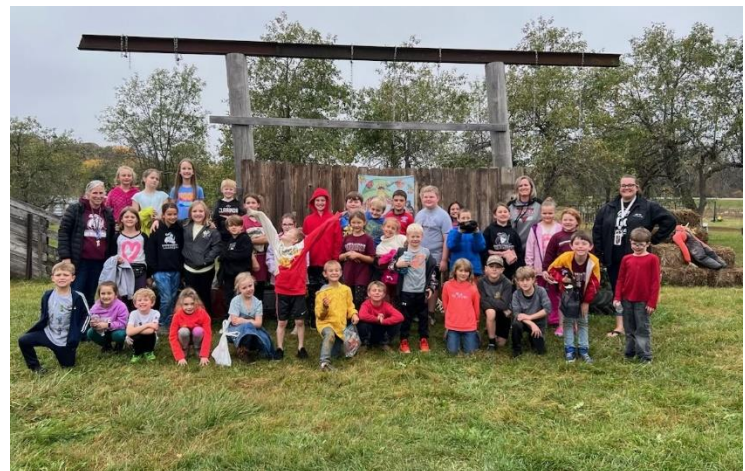
3 Bee Farm Field Trip, Grades 1-4

Questions? Call or text Candice Liljedahl at 712-215-0331